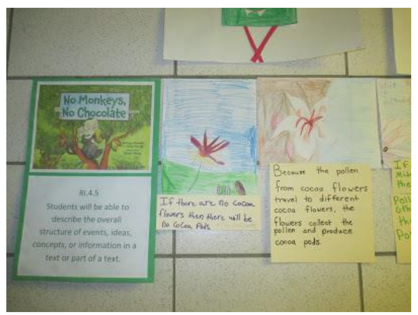
Examples of revised text with cause and effect structure